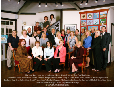
Leadership II Class of 2005