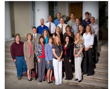
Leadership VI Class of 2009