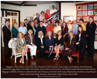
Leadership I Class of 2004