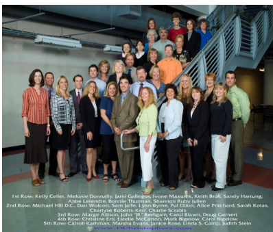
Leadership IV Class of 2007