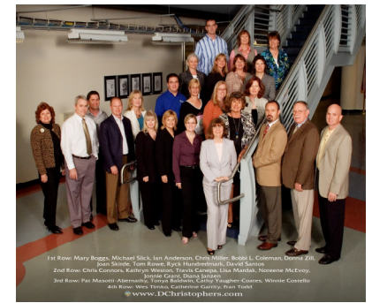
Leadership V Class of 2008

Each session will be held in panel format, with each Presenter covering the most salient points relating to his/her area of expertise.