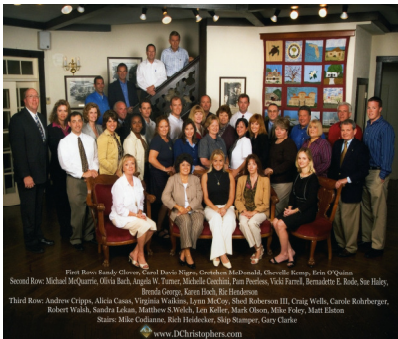
Leadership III Class of 2006