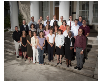
Leadership VII Class of 2010