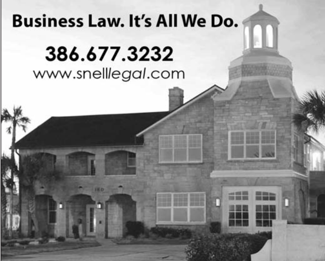
Snell Legal Ormond Beach Office - Historic Fire House